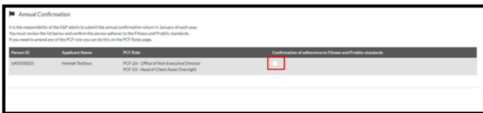
Fig 3.1 – Annual Confirmation

The user should navigate to the ‘Annual Confirmation’ Page of the Fitness and Probity Menu on the Portal. The user should review the list of PCF holders to ensure accuracy. The Admin must then tick to confirm adherence to the Fitness and Probity standards for each PCF function holder. The user will not be able to make the submission until all PCF holders have been selected as confirmed.